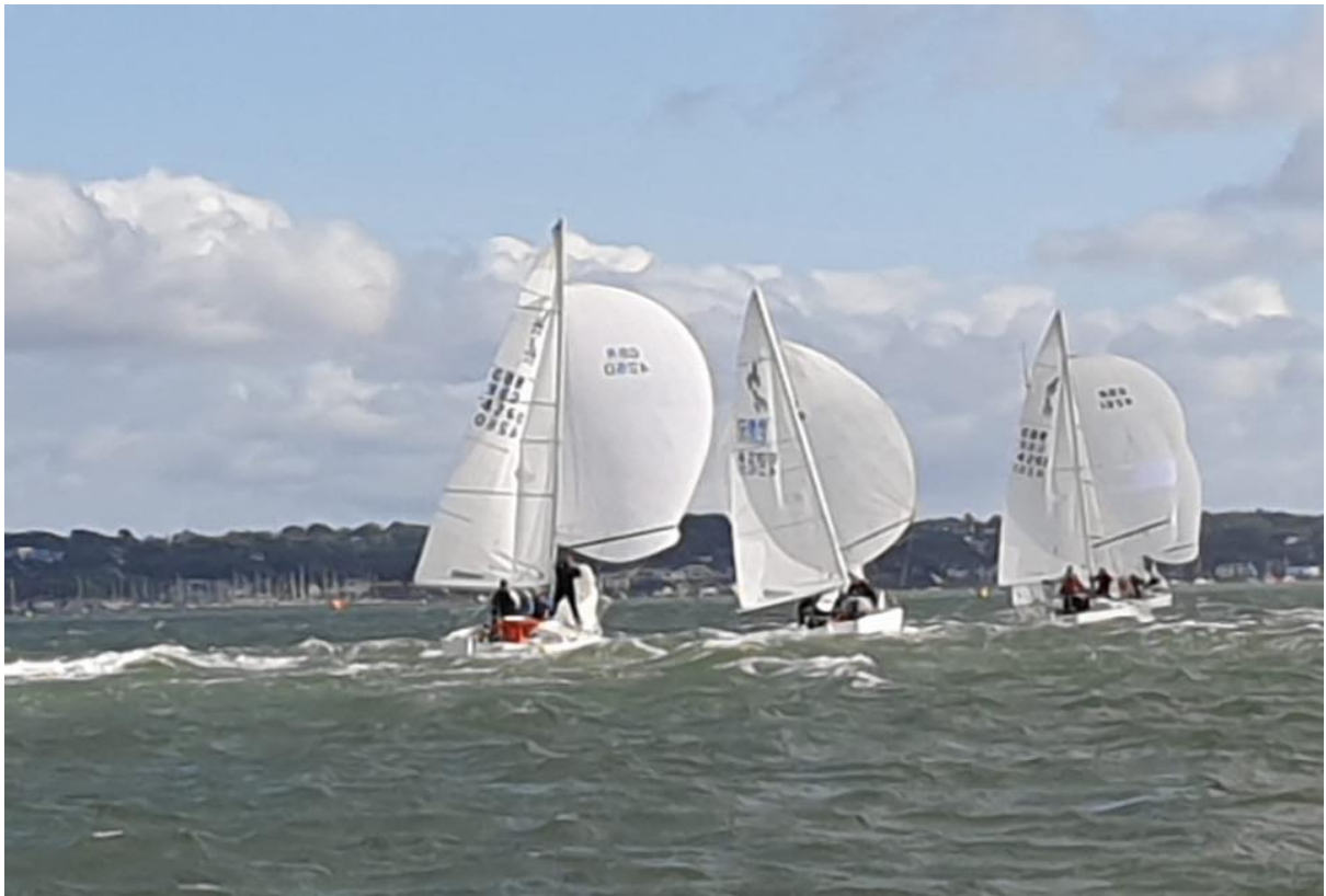
J24s Poole Harbour October 2019