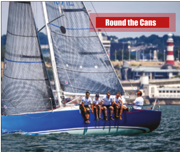
Round the Cans