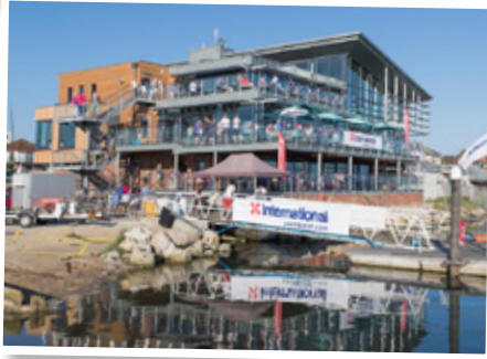
Parkstone Yacht Club