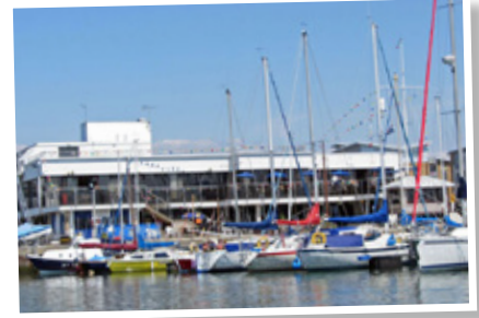
Poole Yacht Club